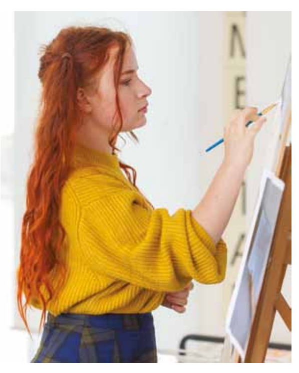
OAT personalise support for our highest ability students in order that they may win places at the best universities