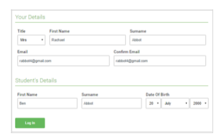
Step 1: Login

Browse to https://ormistonvictory.schoolcloud.co.uk/