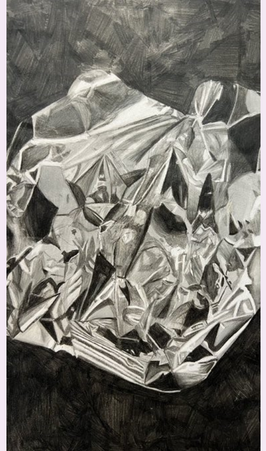
The hours put in to capture this shiny surface by Gracie in Year 12 - beautiful