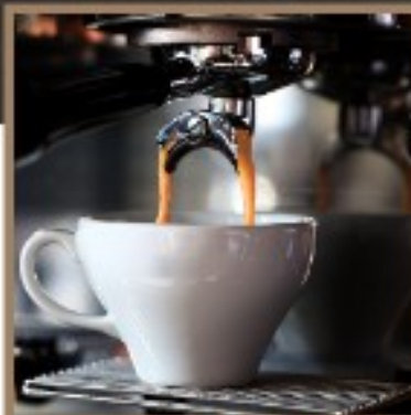
FOR COFFEE LOVERS