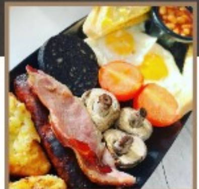
FULL ENGLISH £10.50