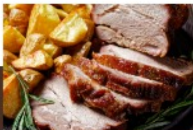
SUNDAY ROAST (12-4PM)