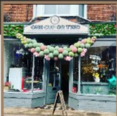
THE COMMUNITY CAFÉ